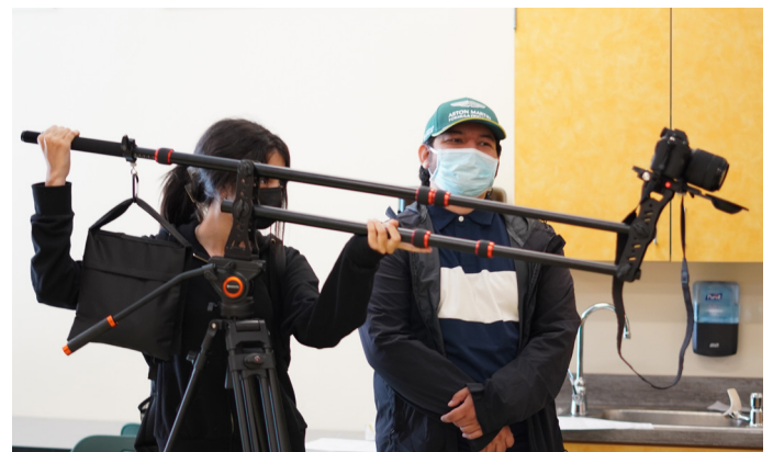
Lodestar Media Arts students at work

Last year, Lodestar launched a Business Academy in collaboration with the Peralta Community College District. Students in this program are taking a series of Dual Enrollment classes that will allow them to earn a Certificate of Proficiency in Entrepreneurship. These classes include Intro to Business, Accounting, E-Commerce/Entrepreneurship, and Small Business Management. Students in the program also work to create their own business plans, engage with local entrepreneurs and compete in several business competitions each year.