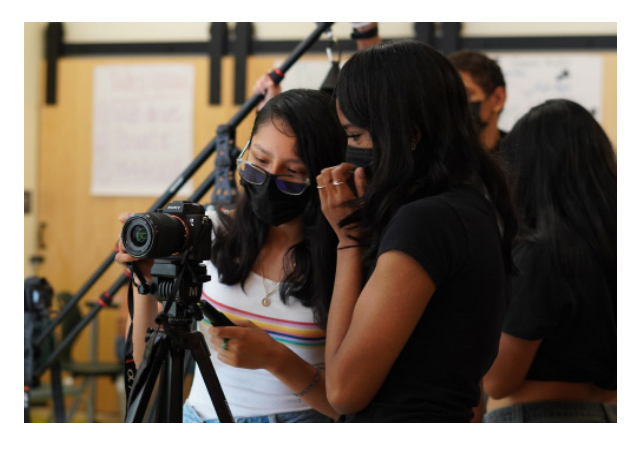
Lodestar Media Arts students at work